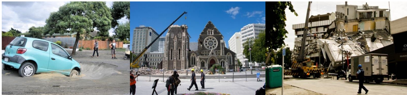
Images of Christchurch following the magnitude 6.3 earthquake which occurred in February 2011.