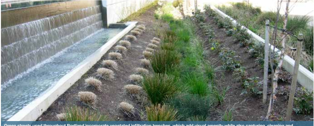
Green streets used throughout Portland incorporate vegetated infiltration trenches, which add visual amenity while also capturing, cleaning and infiltrating storm water.