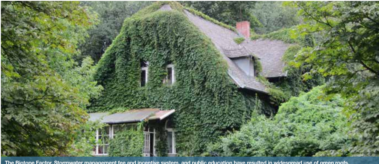
The Biotope Factor, Stormwater management fee and incentive system, and public education have resulted in widespread use of green roof green walls and vegetated private lands such as this property in Spaziergang Rehberge, Berlin.

support it receives, as well as by citizen advocacy for and developer interest in greening the city.<sup>70</sup> This is not to say that economics is not playing an influential role in biophilic urbanism in Germany. Though the 2008 global financial crisis led to budget cuts and significant staff reductions in the Department of Urban Planning and Environment, thus slowing the progress of some programs, the legally binding environmental requirements in place have continued to deliver valuable outcomes.