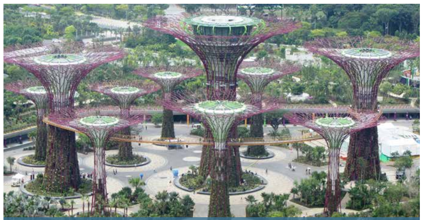
Gardens by the Bay is a 101-hectare site that brings people, nature and technology together. This is the Supertree Grove – the metallic structures are covered in plants and epiphytes, and you can climb the stairs inside for a view of the area.

Toronto: Toronto has a population of 2.7 million people, making it the largest city in Canada and the fifth most populous in North America. Toronto is facing numerous environmental challenges commonly associated with urban development, such as poor air quality, increased urban heat island effects and stormwater management issues.<sup>24</sup> The city has taken many environmental initiatives to address these issues, such as a 'Green Development Standard', a 'Green Economic Sector Development Strategy', a 'Climate Change, Clean Air and Sustainable Energy Action Plan', a 'Climate Change Adaptation Strategy', and an 'Environmental Plan'.<sup>25</sup> In May 2009, Toronto became the first city in North America to adopt a by-law that requires and governs the construction of green roofs, and this applies to all building applications for new residential, commercial, institutional, and industrial developments. The by-law requires green roof coverage of 20 to 60 per cent on all new developments above 2,000m<sup>2</sup> of gross floor area.