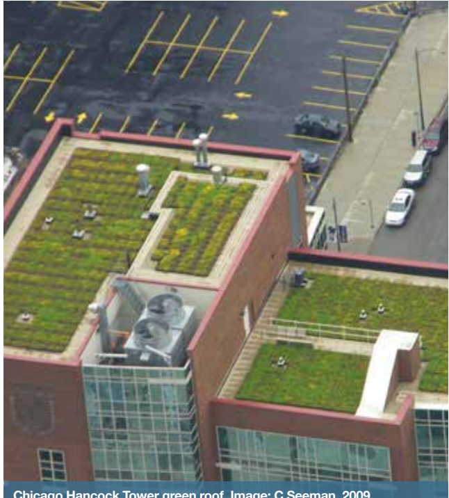
Chicago Hancock Tower green roof. Image: C Seeman, 2009.