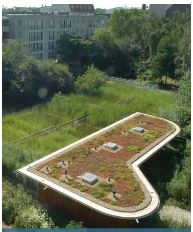
A green roof in Berlin's Potsdamer Platz, where a range of biophilic elements are used to capture, filter and beneficially use rainwater. Image: Secretariat, S., 2010.

For its literature review the project has categorised biophilic urbanism into three scales, namely, the building, neighbourhood, and city scales, as summarised in Table 1. Particular biophilic design elements can provide different benefits at different scales. For example at the building scale, green roofs and green walls reduce energy demand and improve water management, while at higher scales biophilic elements help to alleviate the urban heat island effect and improve air quality and the